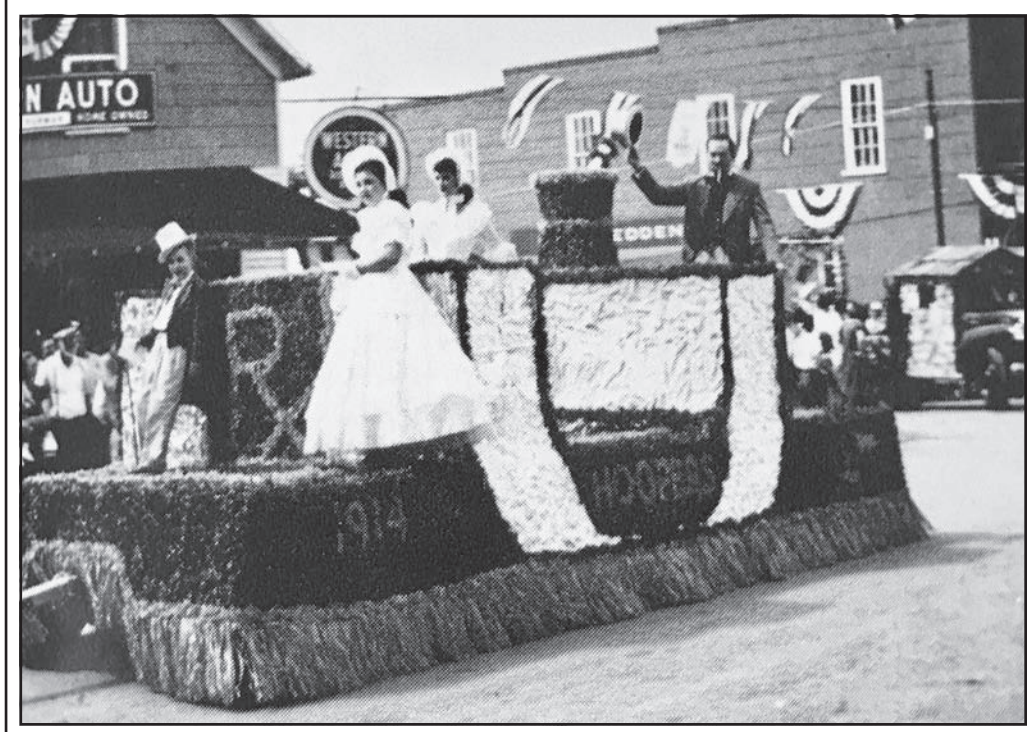
This year will mark the 69th anniversary of the Georgia Mountain Fair Parade, and organizers hope to see more community support than ever in 2019.

For more information about measles, log on to https://www.cdc.gov/measles/ index.html. NT(May8,Z8)CA